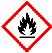
Flammable Liquids Category 3

This material is an Over- The – Counter consumer product that is safe for consumers & workplaces with the intended reasonable and expected manner. NOTE: Warnings below are for exposure to large quantities of the product. Normal usage should not create a hazardous condition.