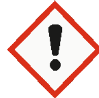
Eye Irritation Category 2A

FLAMMABLE LIQUID AND VAPOR Irritating to eyes